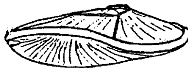
Fig. 7. Ostreopsis siamensis Schmidt. Sketch of a specimen in lateral view. Arrangement of plates not indicated.